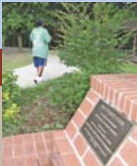
Meandering walking park within driving distance

Come and visit the existing corporation and its expanding facility to see it's positive business climate. We are a caring community that would like to share its assets with you!